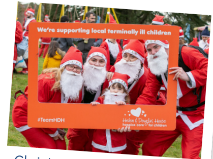
Christmas themed events

Passionate about football, love history or adore another subject? Then why not make it your fundraising theme and create events, like a dressing up day or themed ball, that people pay to enter? Just make sure yours is theme-tastic fun!