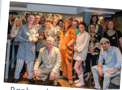
Banbury business owners PJ Day networking event*

Banbury business owners raised a fantastic £370.55 when they pulled on their pyjamas and took part in a Business Buzz networking event. The host donated £2 for every pair of pjs worn and guests tucked into the fabulous cakes on offer for a donation. Thanks everyone!