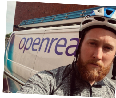
Thank you Openreach!

In 2020, eleven amazing engineers from Openreach spotted we need to raise £3.6m per year and created their own 3.6 challenge. Over seven days, they ran and cycled distances featuring 3 and 6, and they raised an incredible £1,833 for us. Great job guys, thank you! Use social media to show off your fundraising. And don't forget to tag us using #HDHHero.